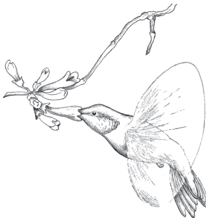
" Trochilus colubris taking food, drawn from memory." From "Ornithophilous Pollination" by Joseph L. Hancock ( The American Naturalist , 1894, 28:679–683).